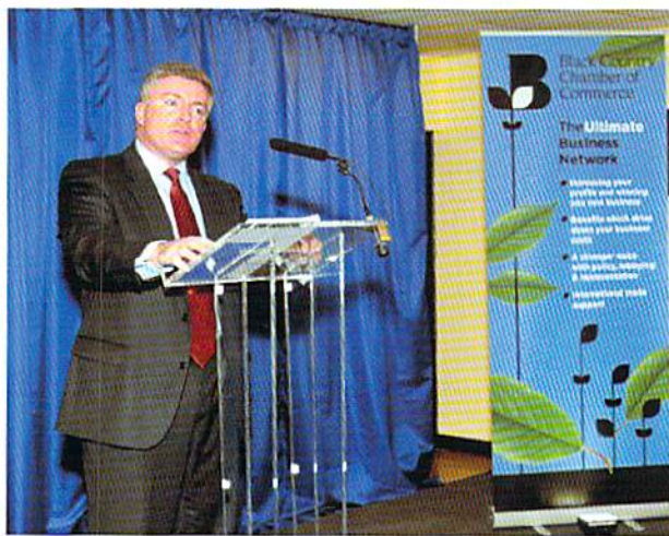
Business Minister Mark Prisk addressing Chamber members

Mr Prisk, who has already revealed plans to replace the regional Business Link organisation with a more centralised body, said the Government believed there was an important role for